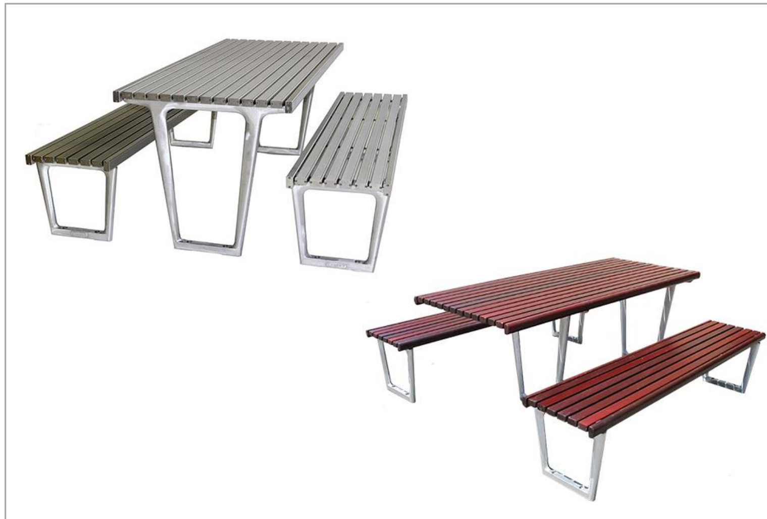
| METRO PICNIC SETTING

Our Picnic Setting range is one of the most comprehensive offerings in Australia. Each unique design is carefully hand-manufactured in our Shepparton Foundry under strict quality guidelines - with the knowledge of how public use can wear products down.