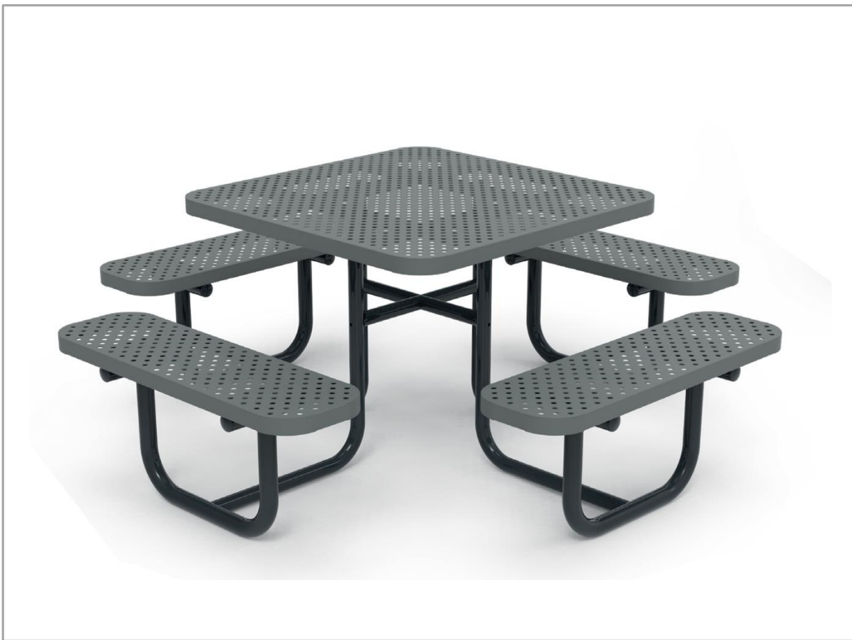
PK. 42753 DIMENSIONS | 1900 x 1900 x 750mm