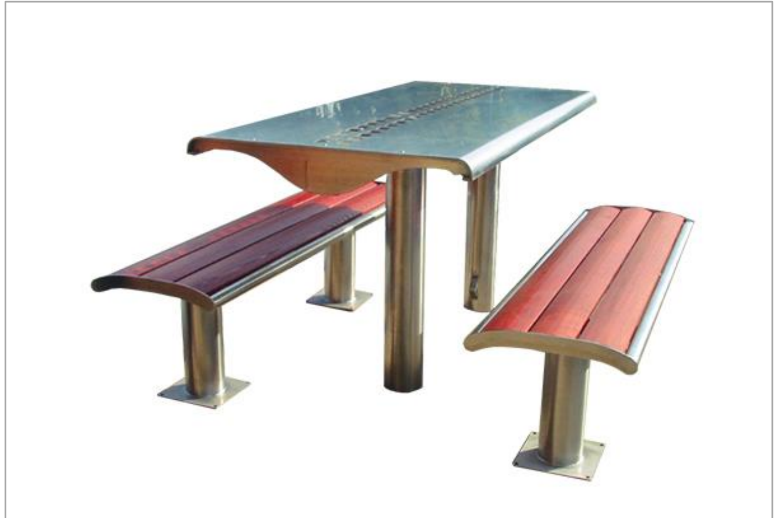
| LYNDARUM PICNIC SETTING

Our Picnic Setting range is one of the most comprehensive offerings in Australia. Each unique design is carefully hand-manufactured in our Shepparton Foundry under strict quality guidelines - with the knowledge of how public use can wear products down.