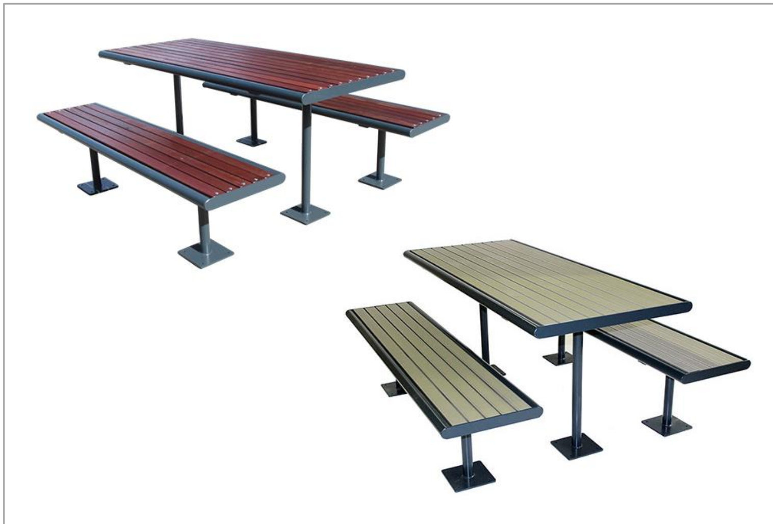
| WOODGROVE PICNIC SETTING

Our Picnic Setting range is one of the most comprehensive offerings in Australia. Each unique design is carefully hand-manufactured in our Shepparton Foundry under strict quality guidelines - with the knowledge of how public use can wear products down.