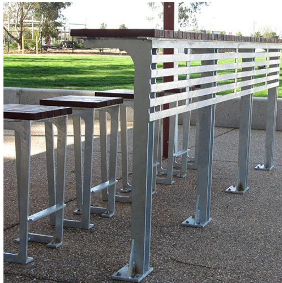
| ESPLANADE BAR FURNITURE

Our Picnic Setting range is one of the most comprehensive offerings in Australia. Each unique design is carefully hand-manufactured in our Shepparton Foundry under strict quality guidelines - with the knowledge of how public use can wear products down.