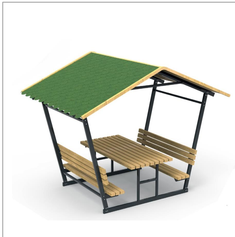
PK. 40502 DIMENSIONS | 2520 X 3700 X 2820mm