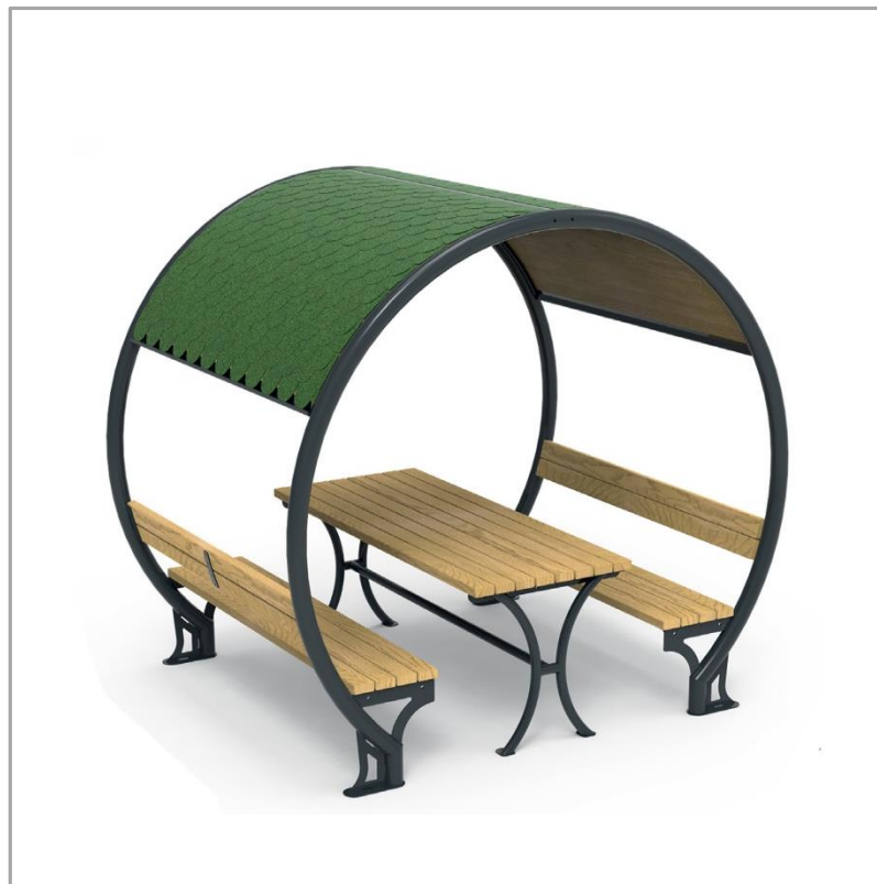
PK. 40505 DIMENSIONS | 1860 X 1940 X 2200mm