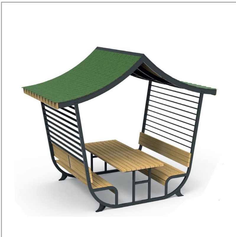
PK. 40504 DIMENSIONS | 2010 X 3280 X 2840mm