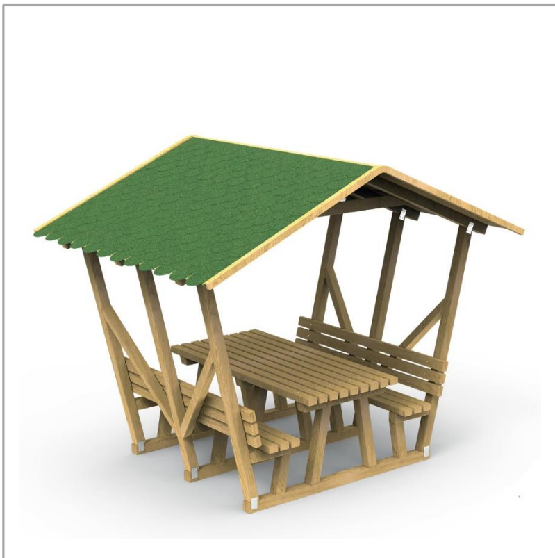
PK. 40501 DIMENSIONS | 2520 X 3700 X 2820mm