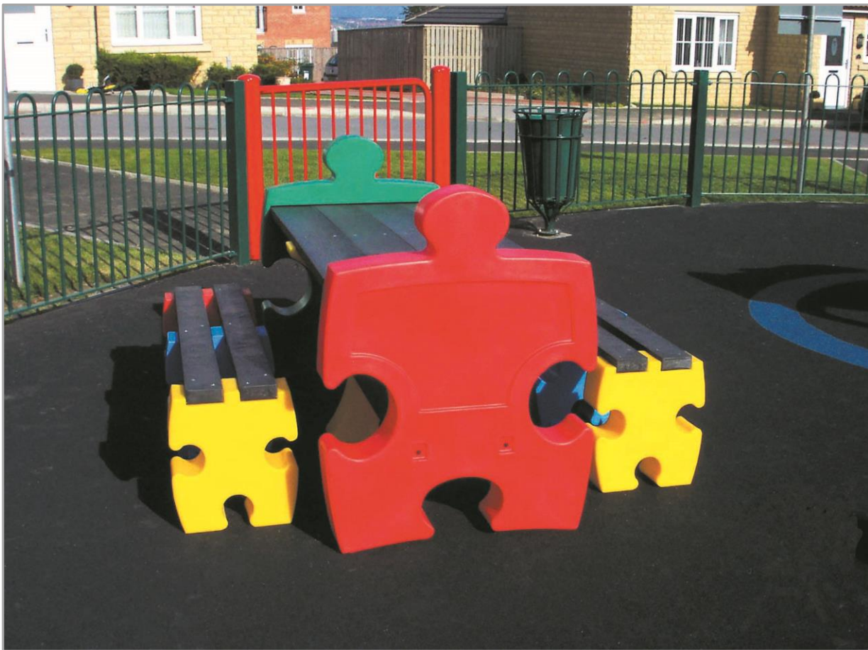
| JUNIOR JIGSAW TABLE SET