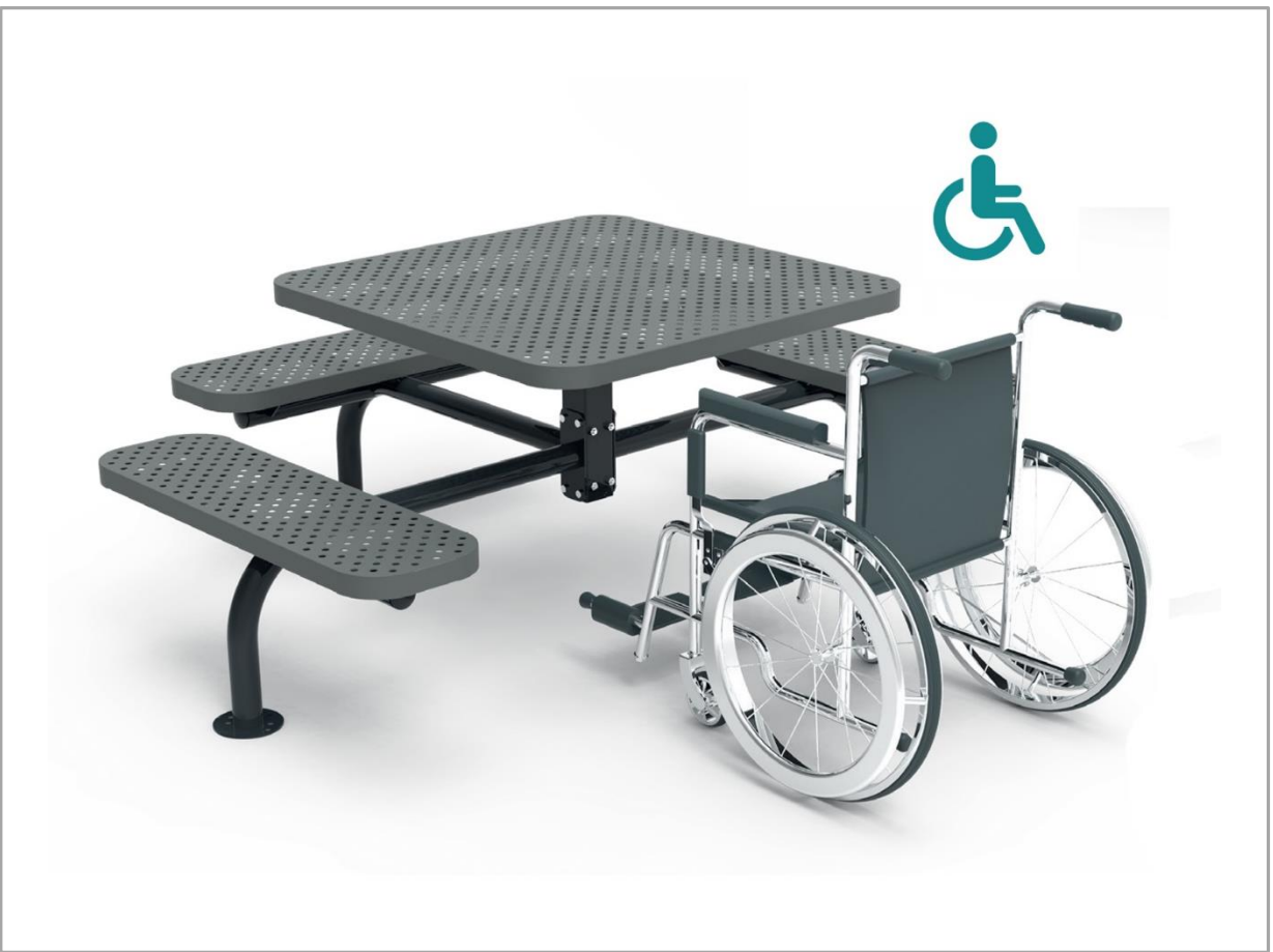
PK. 42756 DIMENSIONS | 1500 x 1950 x 750mm