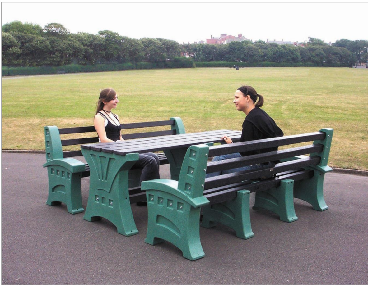
| PREMIER TABLE AND BENCH SET