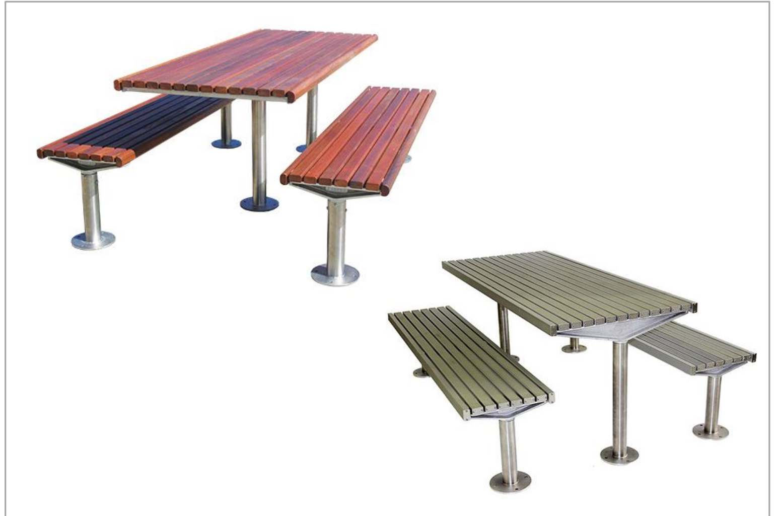
| PROMENADE PICNIC SETTING

Our Picnic Setting range is one of the most comprehensive offerings in Australia. Each unique design is carefully hand-manufactured in our Shepparton Foundry under strict quality guidelines - with the knowledge of how public use can wear products down.