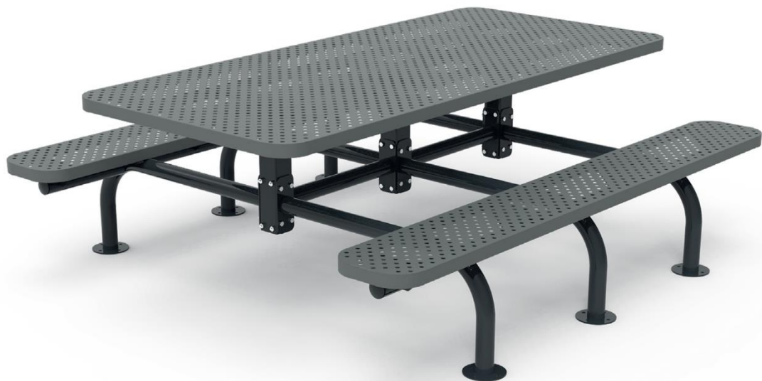
PK. 42757 DIMENSIONS | 1950 x 2170 x 750mm