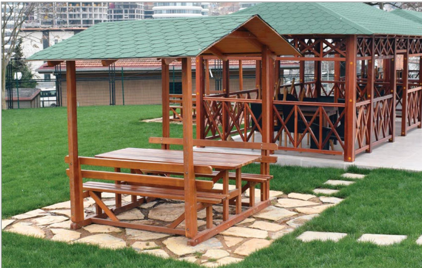
| ROOFED TABLE AND BENCH SET