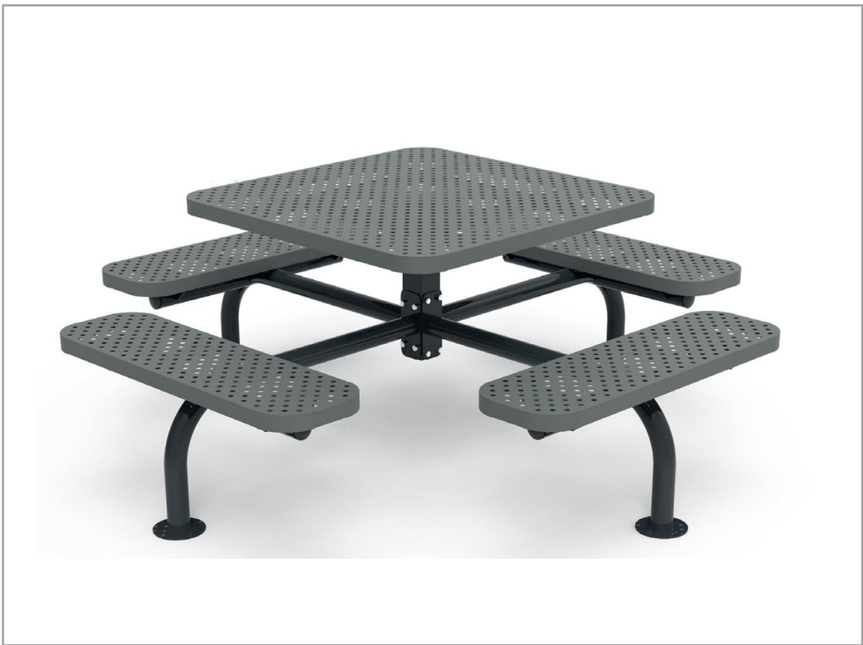
PK. 42755 DIMENSIONS | 1950 x 1950 x 750mm