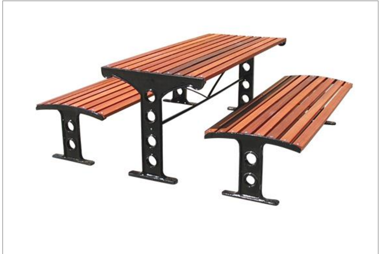
| FIESTA PICNIC SETTING