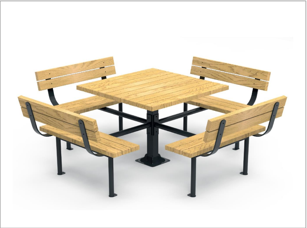
PK. 40752 DIMENSIONS | 2230 x 2230 x 700mm