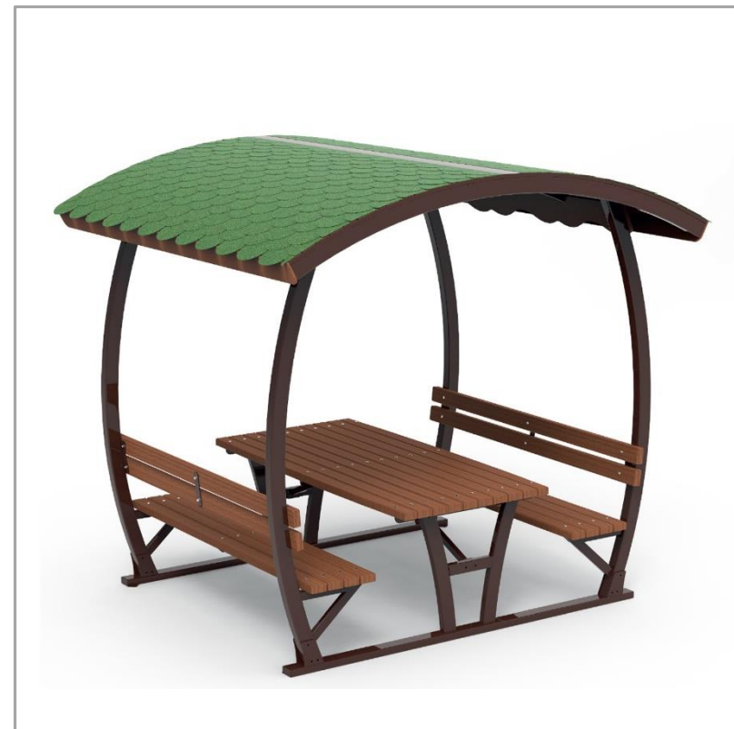
PK. 40506 DIMENSIONS | 2400 X 2530 X 2400mm