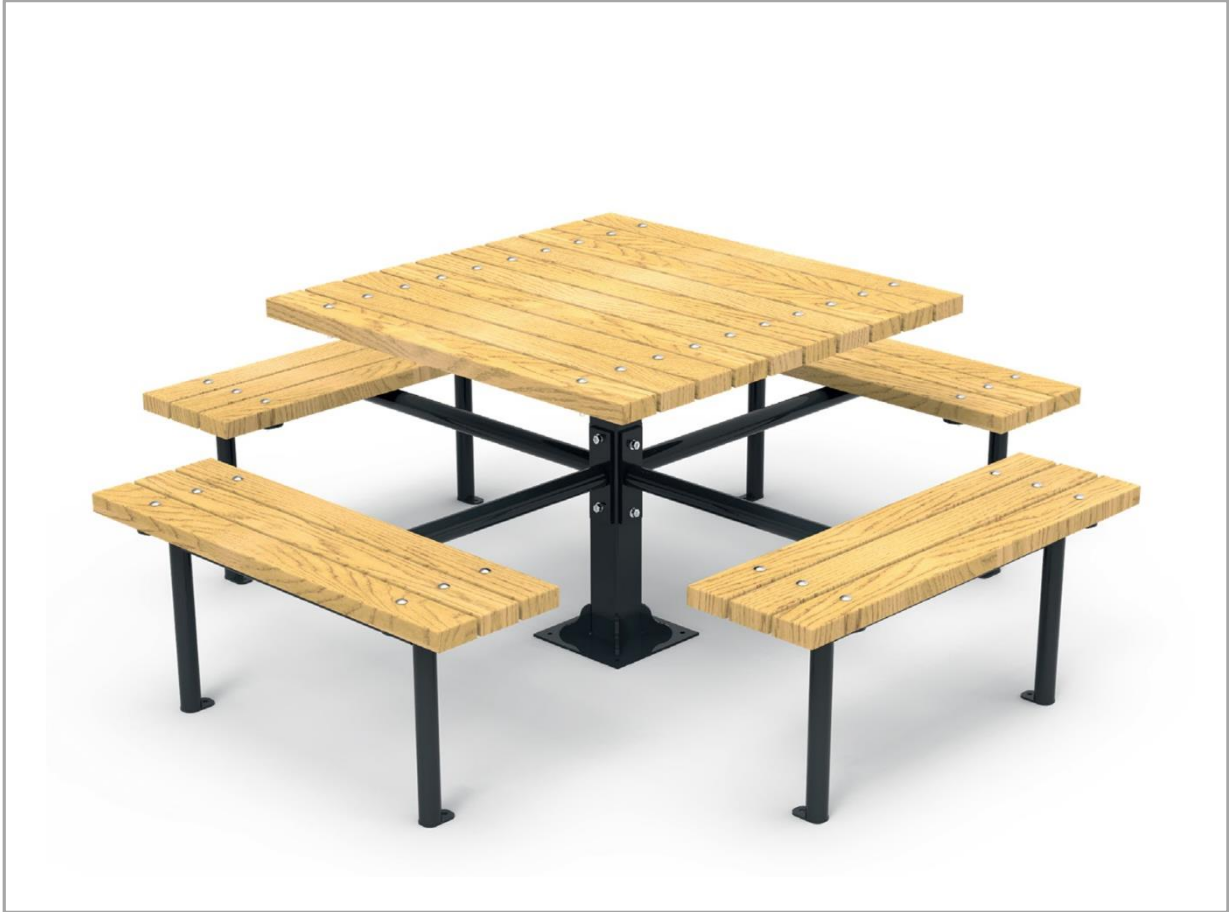
PK. 40753 DIMENSIONS | 1940 x 1940 x 700mm