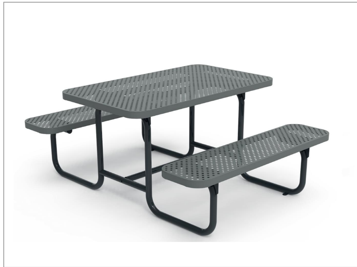
PK. 42754 DIMENSIONS | 1370 x 1800 x 750mm