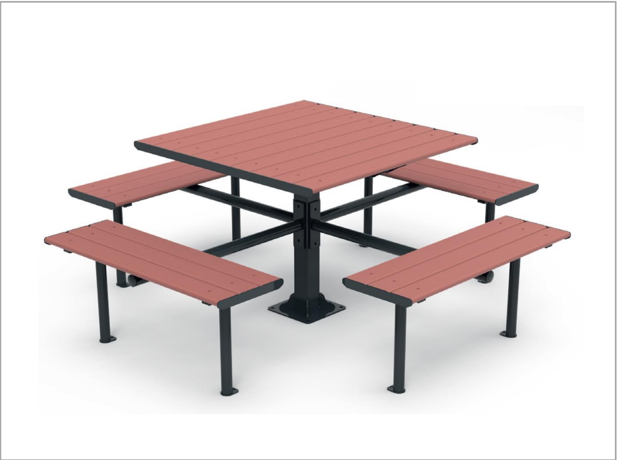
PK. 44762 DIMENSIONS | 1950 x 1950 x 700mm