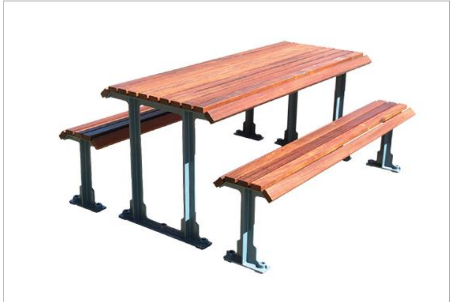
| FORESHORE PICNIC SETTING

Our Picnic Setting range is one of the most comprehensive offerings in Australia. Each unique design is carefully hand-manufactured in our Shepparton Foundry under strict quality guidelines - with the knowledge of how public use can wear products down.