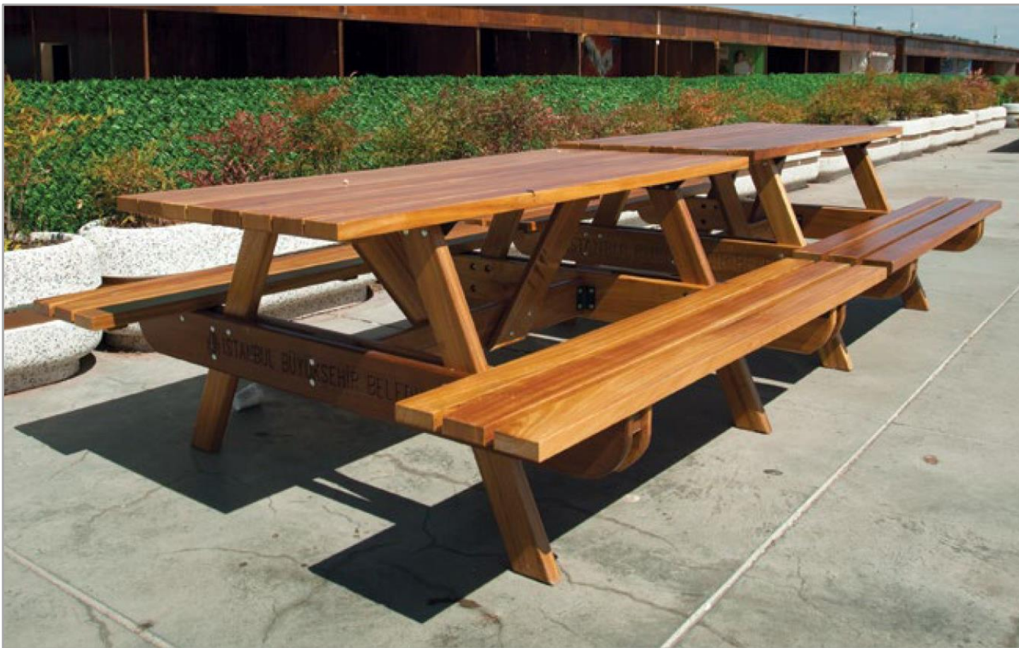
| WOODEN PICNIC TABLE