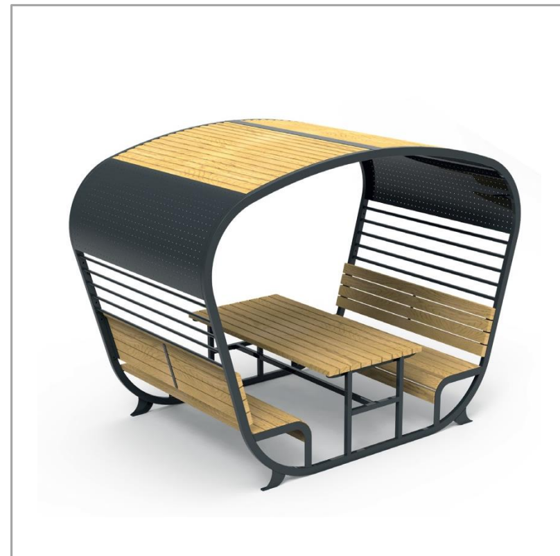
PK. 40503 DIMENSIONS | 1800 X 2920 X 2260mm