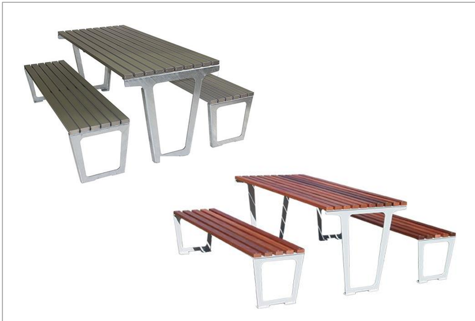
| CIVIC PICNIC SETTING

Our Picnic Setting range is one of the most comprehensive offerings in Australia. Each unique design is carefully hand-manufactured in our Shepparton Foundry under strict quality guidelines - with the knowledge of how public use can wear products down.