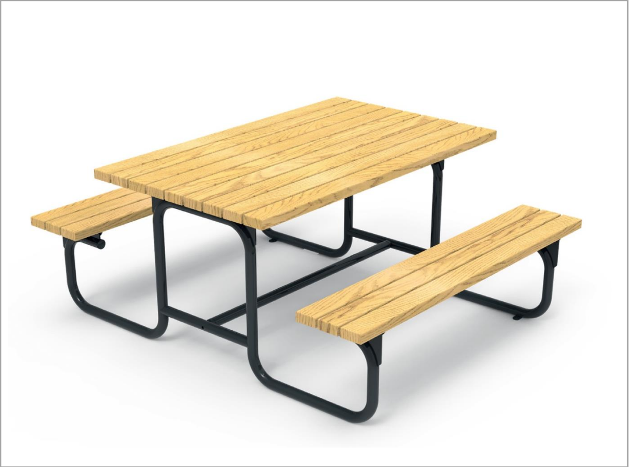
PK. 40754 DIMENSIONS | 1480 x 1770 x 750mm