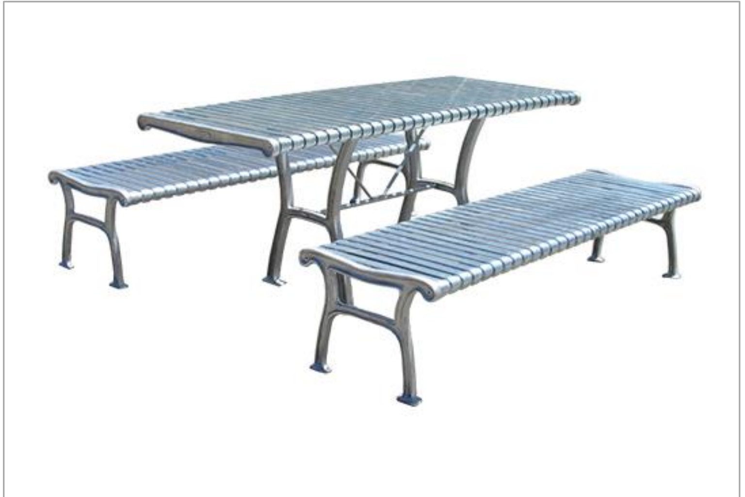
| STEEL SLATED COUNCIL PICNIC SETTING

Cast Aluminium Ends Mild Steel Vertical Slats Length 2000 mm Bolt Down Attachment Powder Coat Finish Accessible Options