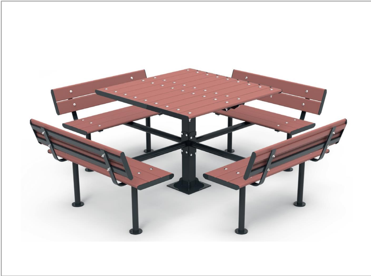
PK. 44761 DIMENSIONS | 2230 x 2230 x 700mm