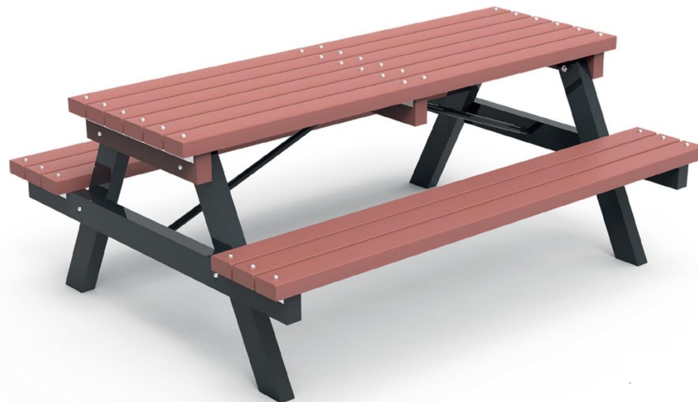
PK. 44760 DIMENSIONS | 1740 x 1800 x 750mm