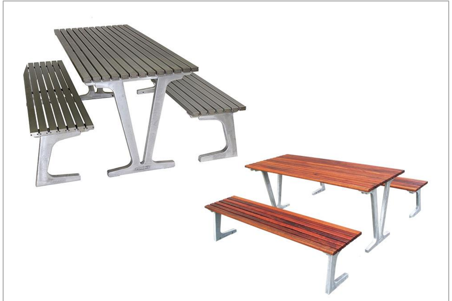
| FULCRUM PICNIC SETTING

Our Picnic Setting range is one of the most comprehensive offerings in Australia. Each unique design is carefully hand-manufactured in our Shepparton Foundry under strict quality guidelines - with the knowledge of how public use can wear products down.