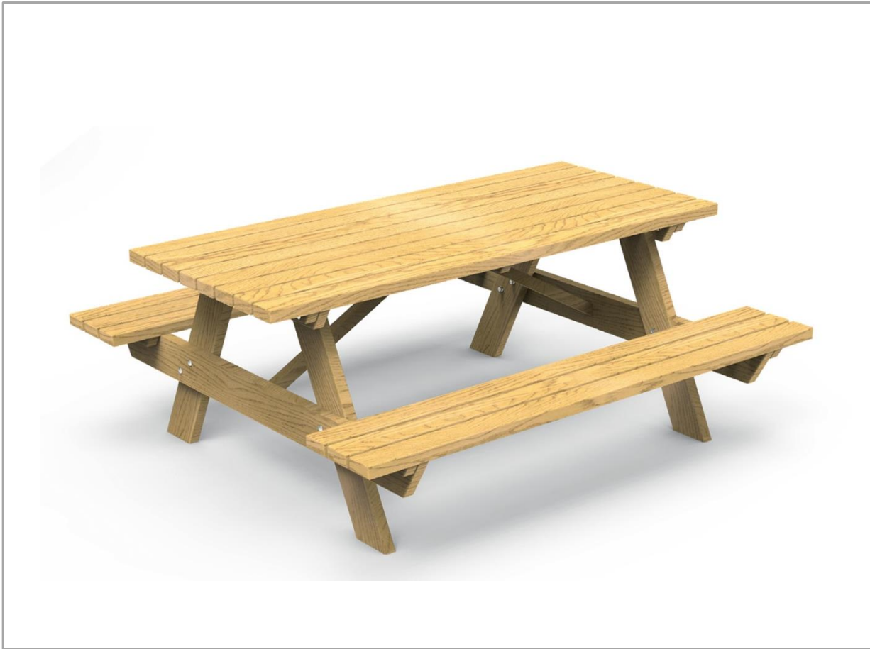
PK. 40751 DIMENSIONS | 1710 x 1850 x 750mm